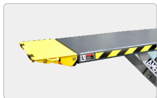
Movable drive-in ramps, and extendable platform.