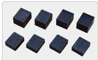
Both 38mm and 75mm height rubber pads included as standard supply.