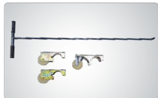
Standard with portable kits include mobile bracket wheel and pulling bar.