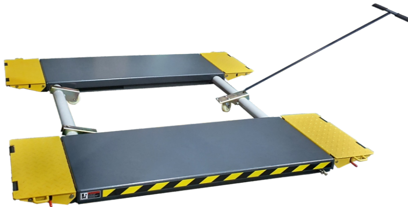
Portable design, mobile easily.