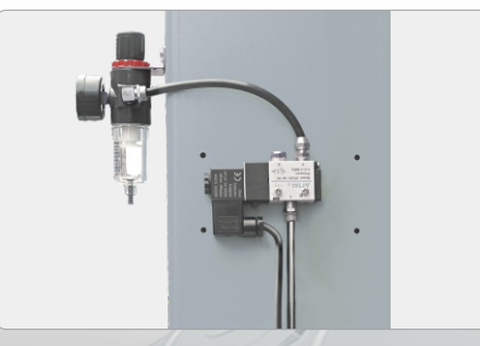
Oil-water separator and Solenoid air valve are installed on the power side column.

With C.E. stop switch at 300mm from ground and alarm tone when lowering down from 300mm to ground make the lift more safety.