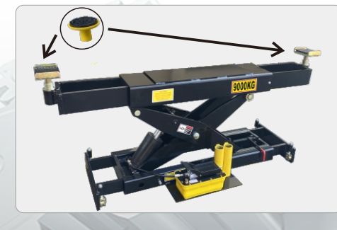
Optional Rolling Jack RJ-20A pneumatic hydraulic type 9.0T.