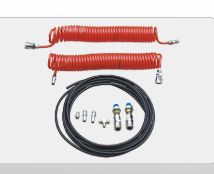
Optional airline kits. Easy to install with all models of rolling jacks with pneumatic pump. Kits No.:40106