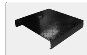
Optional length extension kit adds an extra 400mm length on the platform for the long axle vehicle. Kits No.: MC002