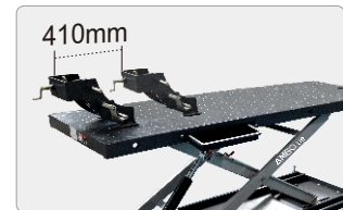
Front Wheel Vise Front wheel vise with an adjustable positioning distance of 410mm.