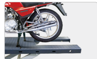
Rear Tire removal cover removable platform cover plate is convenient for rear wheel changing.