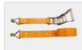
Optional vehicle securing belt tightens the vehicle before lifting. Kits No.: MC006