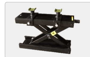
Optional lifting jack lifting capacity: 500kg. Perfect for wheel removal. Kits No.: MC005